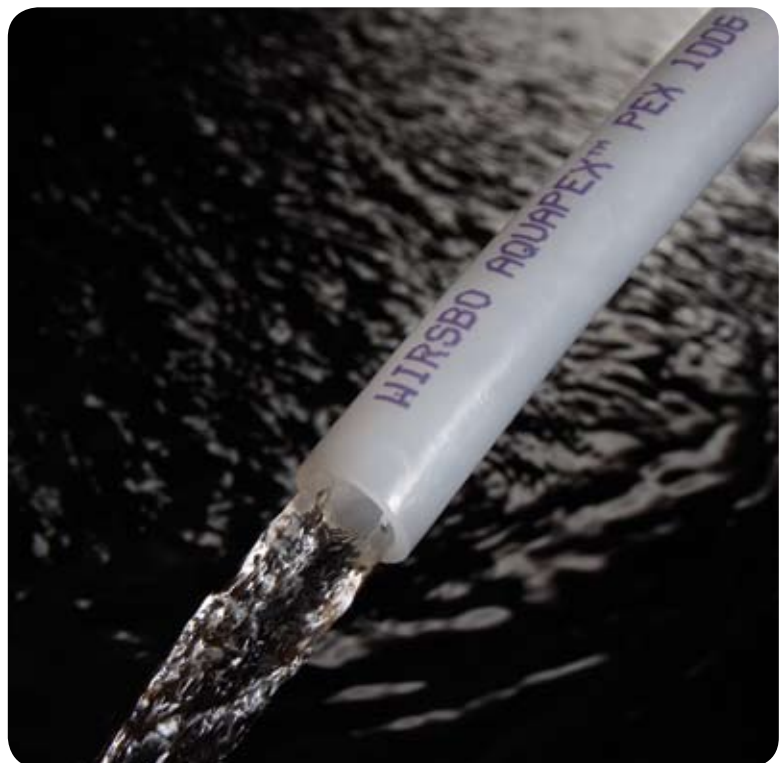
Uponor PEX tubing includes Wirsbo AQUAPEX®, Wirsbo AQUAPEX plus and Wirsbo hePEX™ plus.

When you build for a lifetime, build with Uponor PEX.