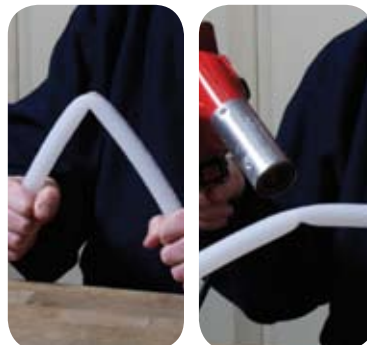
Kinks in Uponor PEX are easily repaired with a heat gun.

Only high-performance manufacturing can deliver a high-performance product.